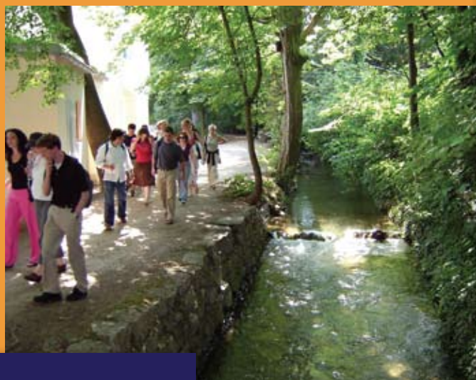
Students begin a trek by the Mill Stream in Baden out into the neighboring woods and vineyards.